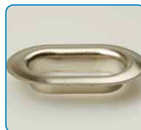
OVAL TIR 42 x 22