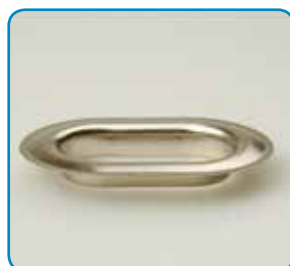
OVAL TIR 40 x 10